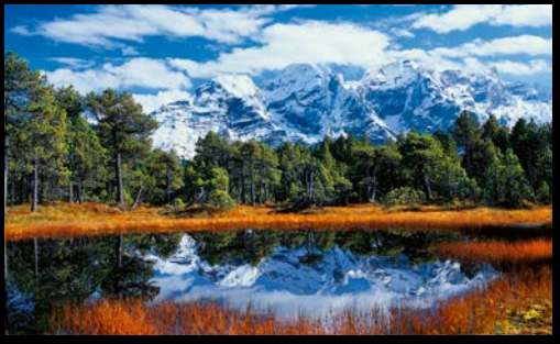
O C T O B E R Chaltenbrunnen and the Engelhörner, Bernese Oberland, Switzerland