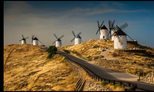
N O V E M B E R Consuegra, Province of Toledo, Spain