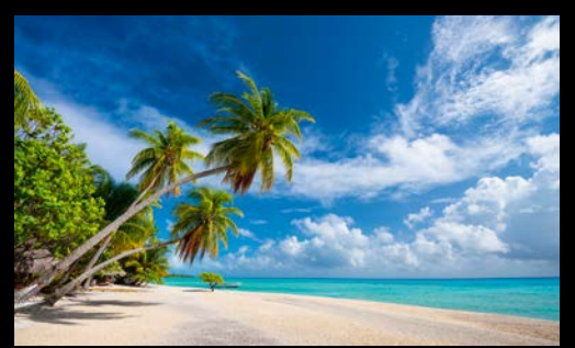
S E P T E M B E R Le Sauvage Private Island, French Polynesia

A U G U S T Chambers Pillar, Northern Territory, Australia