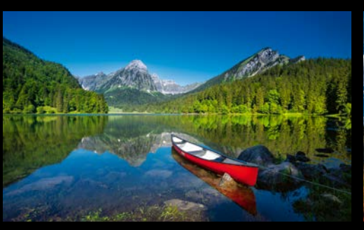
J U L Y Obersee and Brünnelistock mountain, Glarnerland, Switzerland