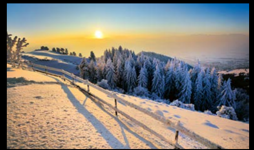
J A N U A R Y St. Anton, Appenzell, Switzerland