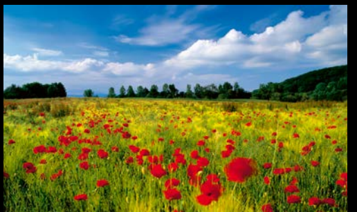
M A Y The Vaud countryside, Canton of Vaud, Switzerland

A P R I L Rena Majori Beach, Sardinia, Italy