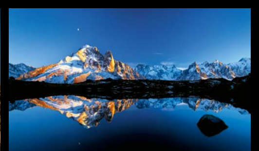
DECEMBER The Chamonix Aiguilles, Haute-Savoie, France